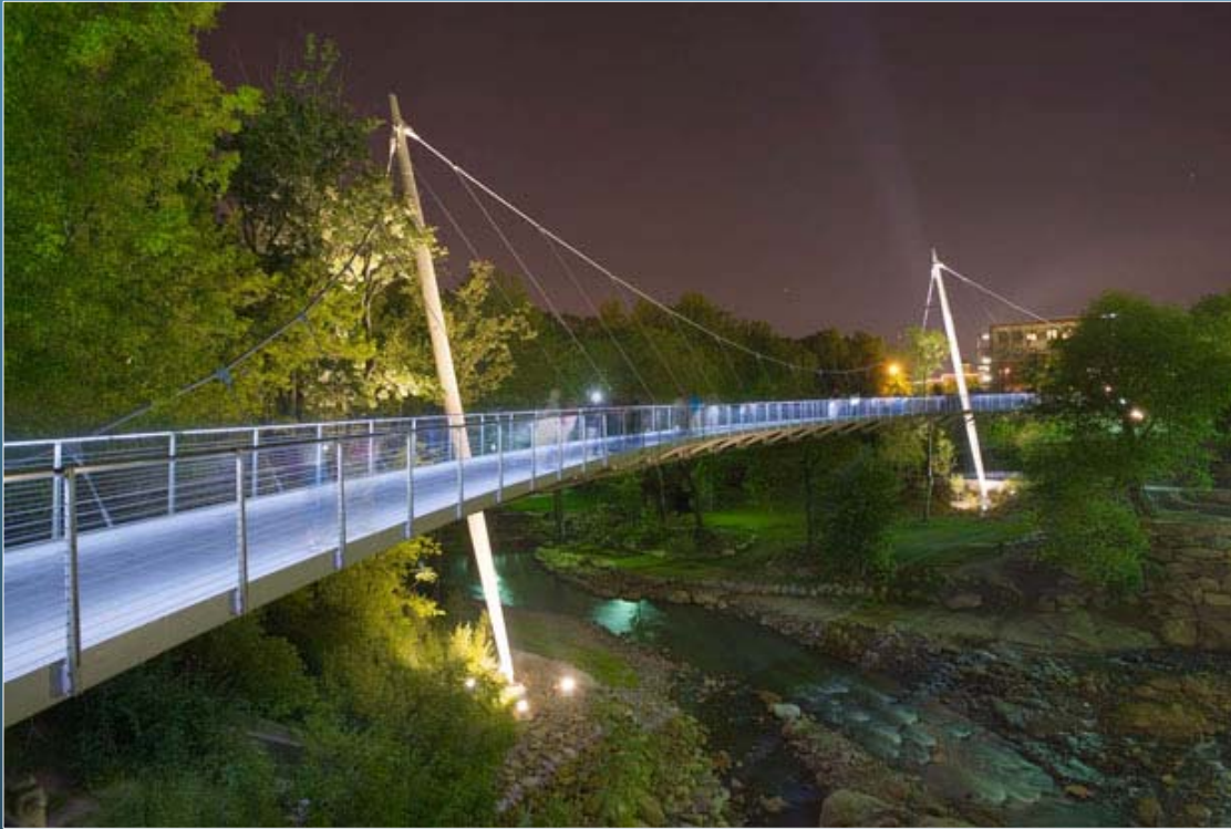
Signature Pedestrian Footbridge