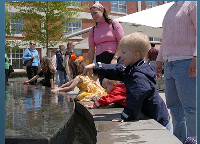
Urban Design & Gateway Treatment