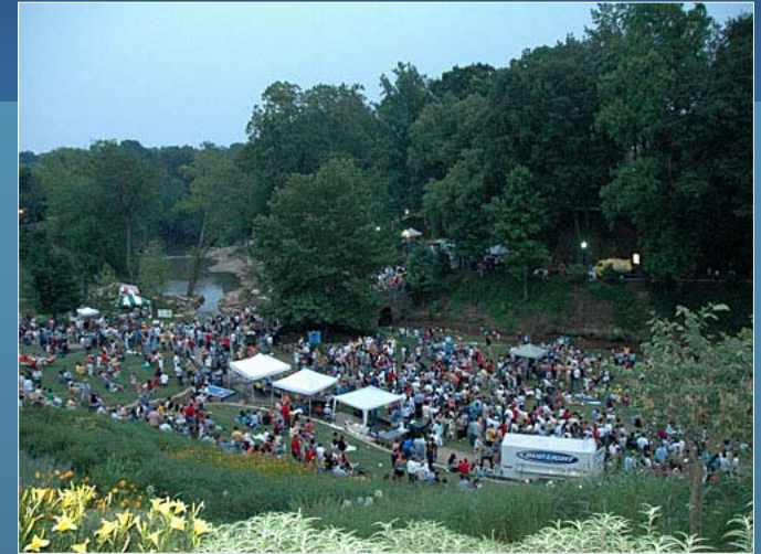
Civic Events on Floodplain