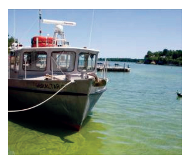
A cyanobacterial bloom in Lake Erie. It's impossible to tell visually, by taste or odor whether such a bloom is toxic (a HAB). Water samples must be analyzed for the presence of toxins.