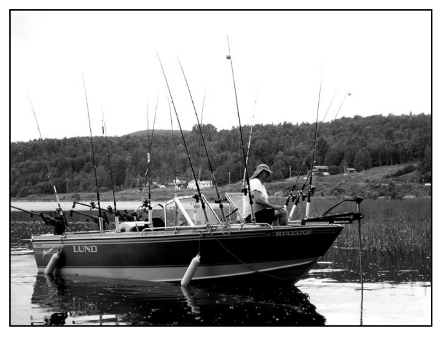
Fig. 5–1. Great expectations! Some anglers have unrealistic expectations about the size and availability of fish for harvest in small lakes. Acre-for-acre comparisons, however, show that small lakes produce more fish than large lakes.

The New York State Department of Environmental Conservation (DEC) is responsible for managing fisheries in New York State. As DEC conducts its own scientific surveys on most lakes, their staff may also gather information in partnership with other groups such as universities, conservation organizations, lake associations, and rod and gun clubs. With guidance from a professional fisheries biologist, citizens can gather very accurate fisheries data on their lake.