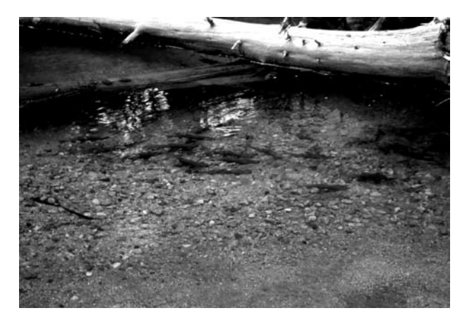
Fig. 5–3. Deadfalls and woody debris attract fish by providing structure and substrate for their food, but they are often removed during shoreline development.

Woody debris or deadfalls provide shelter and feeding stations for many fish species. The presence and density of many pan fish (sunfish, rock bass, bullheads and yellow perch) and game fish (pike and smallmouth bass) are highly dependent upon the amount of deadfalls in a lake. Deadfalls also provide substrate for algae and invertebrates, which increases overall lake productivity. In spite of these positive attributes, deadfalls are the most frequent thing people remove on "lake clean-up days."