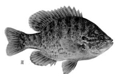
Fig. 5–12. Bluegill (Lepomi macrochirus)