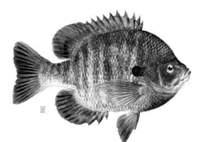
Fig. 5–11. Pumpkinseed sunfish (Lepomis gibbosus)