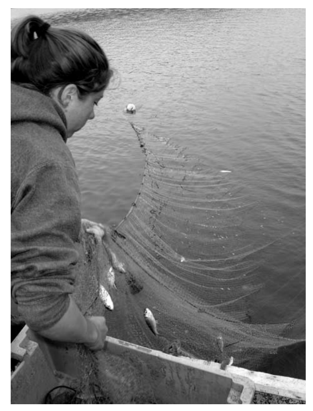
Fig. 5–5. Gill nets are used sparingly by professional fisheries biologists to sample fish populations throughout a lake.

Seine nets are typically small-meshed nets that are used to capture young fish, and are only effective when used close to shore.