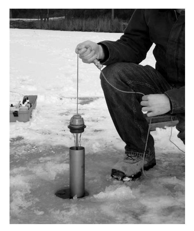
Fig. 5–4. Late-winter water-quality sampling may indicate limiting factors, such as low oxygen levels, that will reduce fish survival and production. The device shown can collect samples at various depths beneath the ice.

Critical environmental conditions happen sporadically. Hot dry summers and severe winters may occur infrequently. When a fishkill is the result of a transient event, conditions can be back to normal before a sampling team can isolate the problem. It is important to remember, however, that although fish abundance, survival and productivity can be limited by transient events, physical, chemical and biological conditions support fish 99.9 percent of the time.