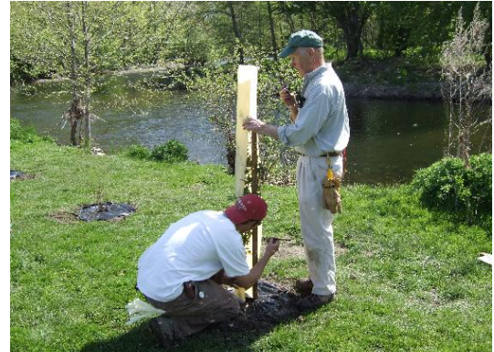
Installing a tree tube during a "Trees for Tribs" buffer planting project on Wappingers Creek, Poughkeepsie

More information on these techniques is available in the NYSDEC Handbook: Conserving Natural Areas and Wildlife in Your Community: Smart Growth Strategies for Protecting the Biological Diversity of New York's Hudson River Valley .