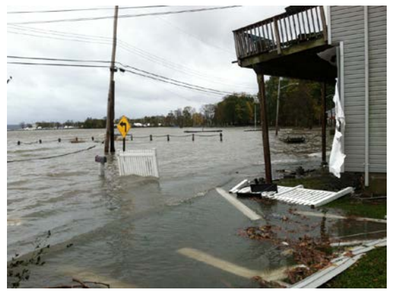
View of flooded road in Stony Point following Hurricane Sandy in 2012

State and federal agencies offer financial assistance to municipalities and non-profit organizations for activities building resilience to waterfront flooding, sea level rise and other climate risks. This document provides an overview of these assistance programs and how to apply. Eligible activities include municipal planning, improving the resiliency of structures, emergency management planning, waterfront revitalization, public outreach, and floodplain protection. A summary table of all resources, organized by agency, areas of assistance and deadlines, can be found at the end of this document.