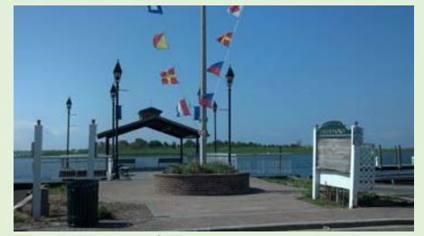
The Village of Freeport received a $250,000 grant to replace over 1,000 feet of bulkhead at Waterfront Park to reduce soil erosion and improve public safety and recreational access.