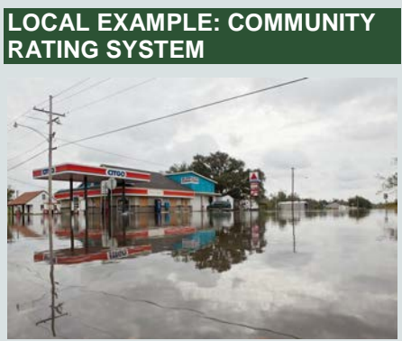
The Village of Scarsdale is Class 8 certified in the Community Rating System (CRS), which means the village residents receive a 10% discount on flood insurance. The Village of Hyde Park is currently seeking CRS certification.

Contact: FEMA grants are administered by NYS Division of Homeland Security and Emergency Services (DHSES). Visit their website for current grant opportunities: http://www.dhses.ny.gov/grants/