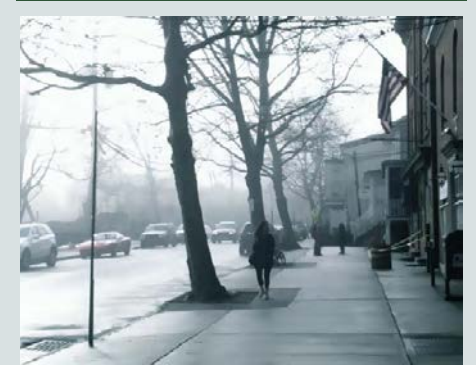
The Village of Piermont received a $35,000 grant to update its Local Waterfront Revitalization Plan, first written in 1992, to include strategies from the Task Force's final Resilience Roadmap Report.

The Brownfield Opportunity Areas (BOA) Program provides municipalities and community based organizations with technical and financial assistance to complete area-wide approaches to redeveloping and revitalizing brownfield areas – abandoned, underused or overgrown industrial or commercial sites. Funds cover up to 90% of project costs on a reimbursement basis.