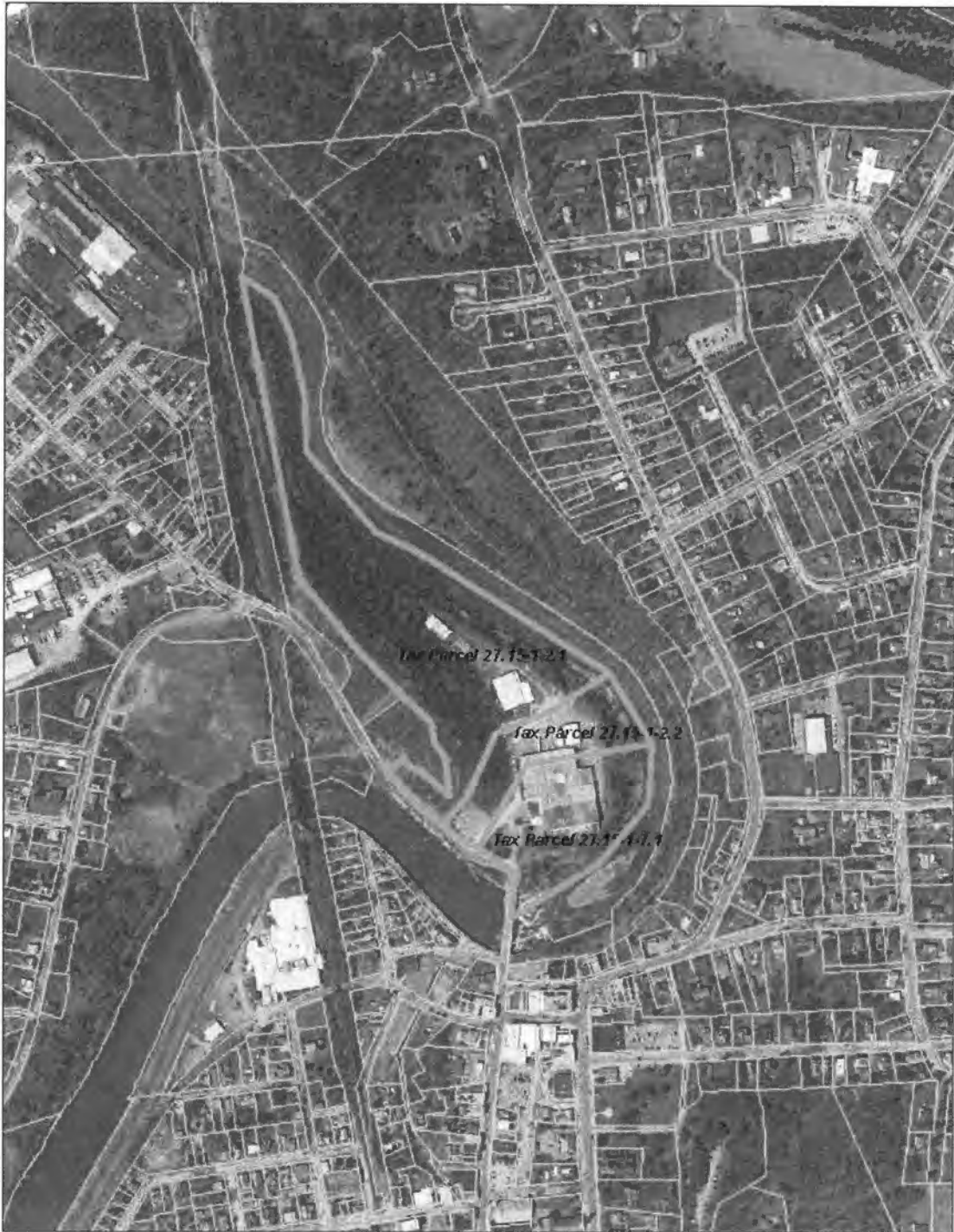
Exhibit A 442050 Allied-Signal Laminate Systems - Mechanic Street Site Boundaries - Based on Tax Parcels