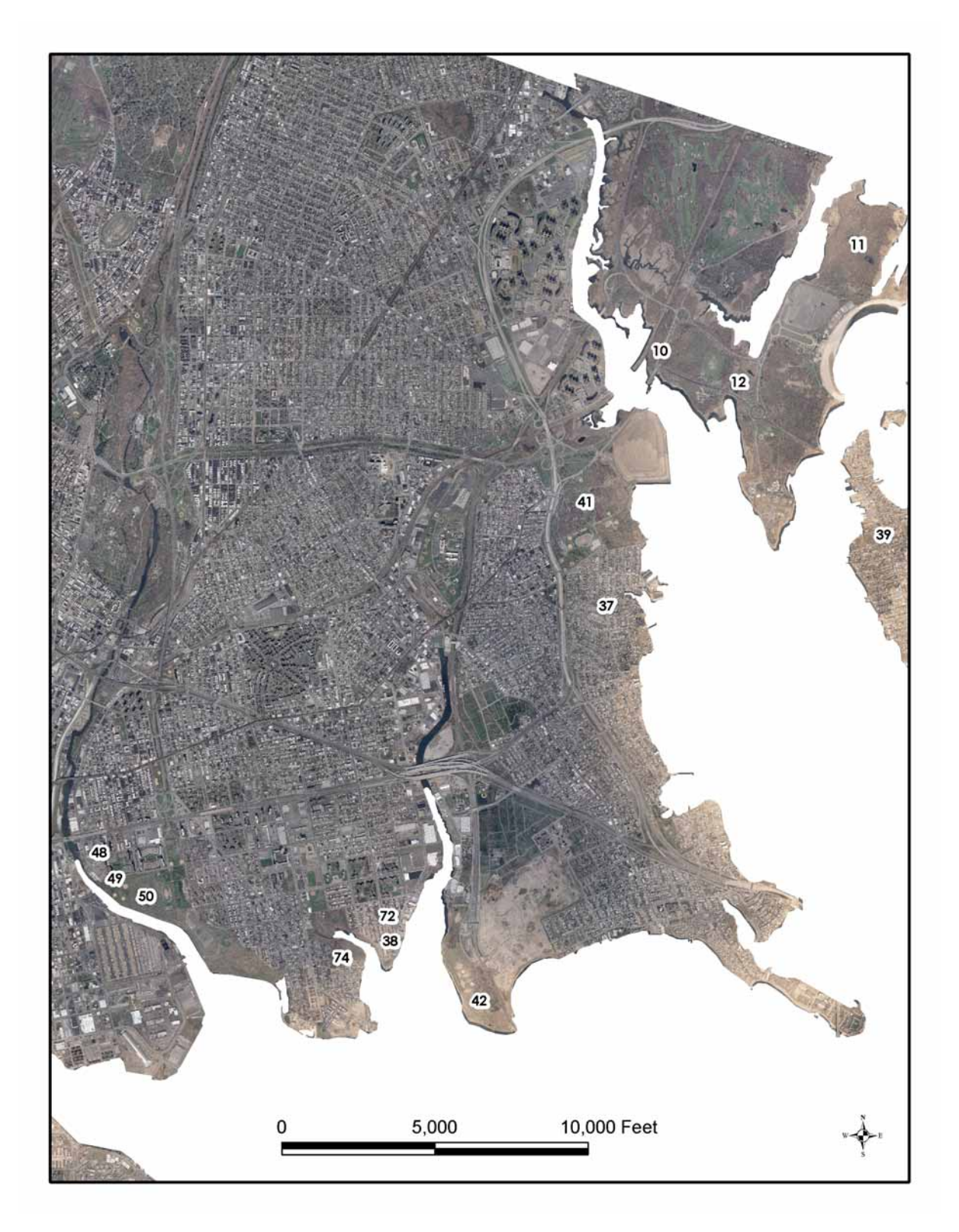
Restoration of Natural Resources through the Jamaica Bay Damages Account - 2007 Update Page 19