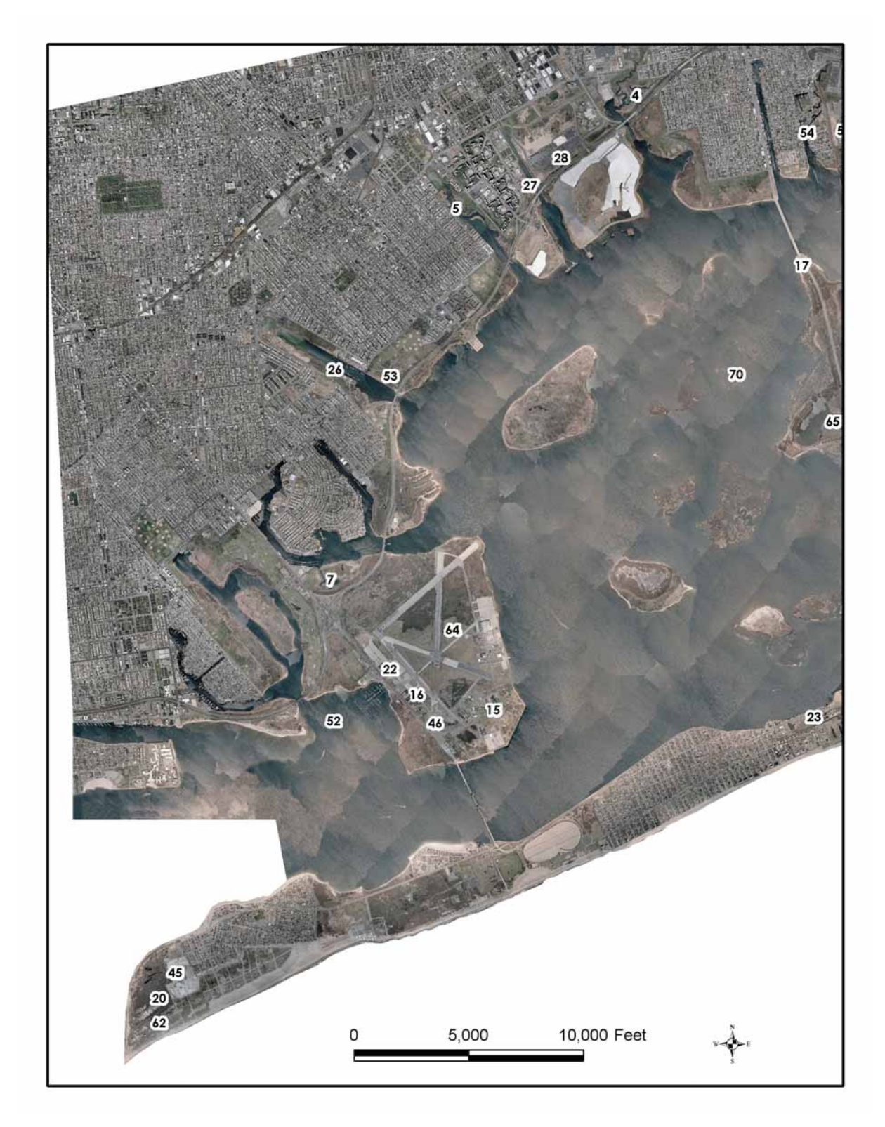
Figure 2. JBDA proposal sites in Western Jamaica Bay