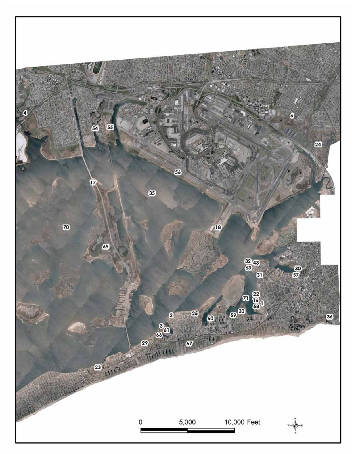
Restoration of Natural Resources through the Jamaica Bay Damages Account - 2007 Update Page 16