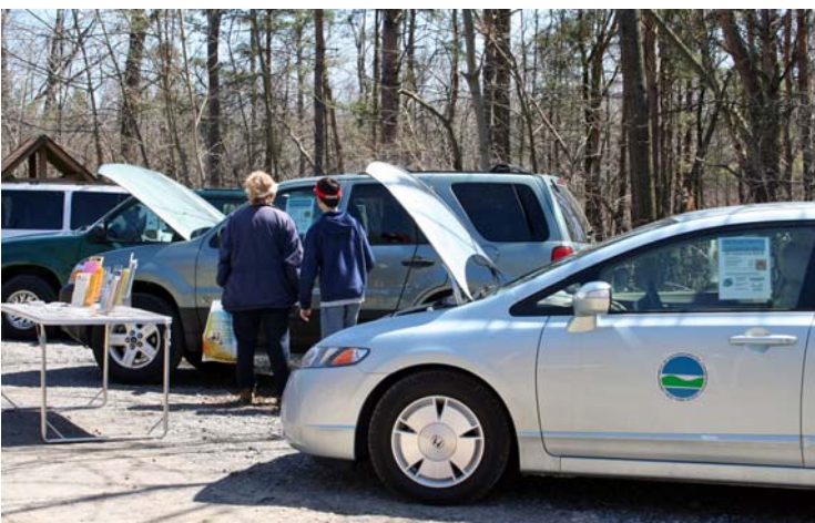
Check out information on DEC's hybrid vehicles and compare the fuel usage with regular cars.