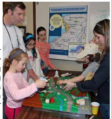
Learn about water pollution and how you can help prevent it.

As the date approaches, watch our website for more details, or call 716-683-5959.