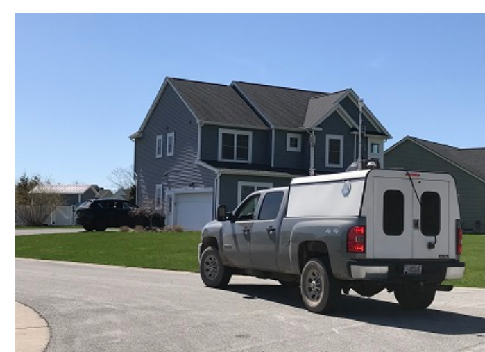
EPA's GMAP vehicle performing real-time monitoring for pollutants and other air quality issues.