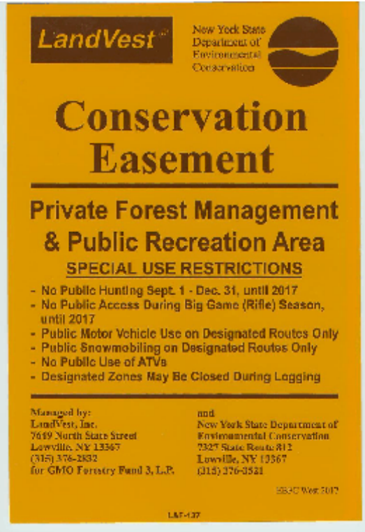
GMO Limited Public Recreation Area Sign