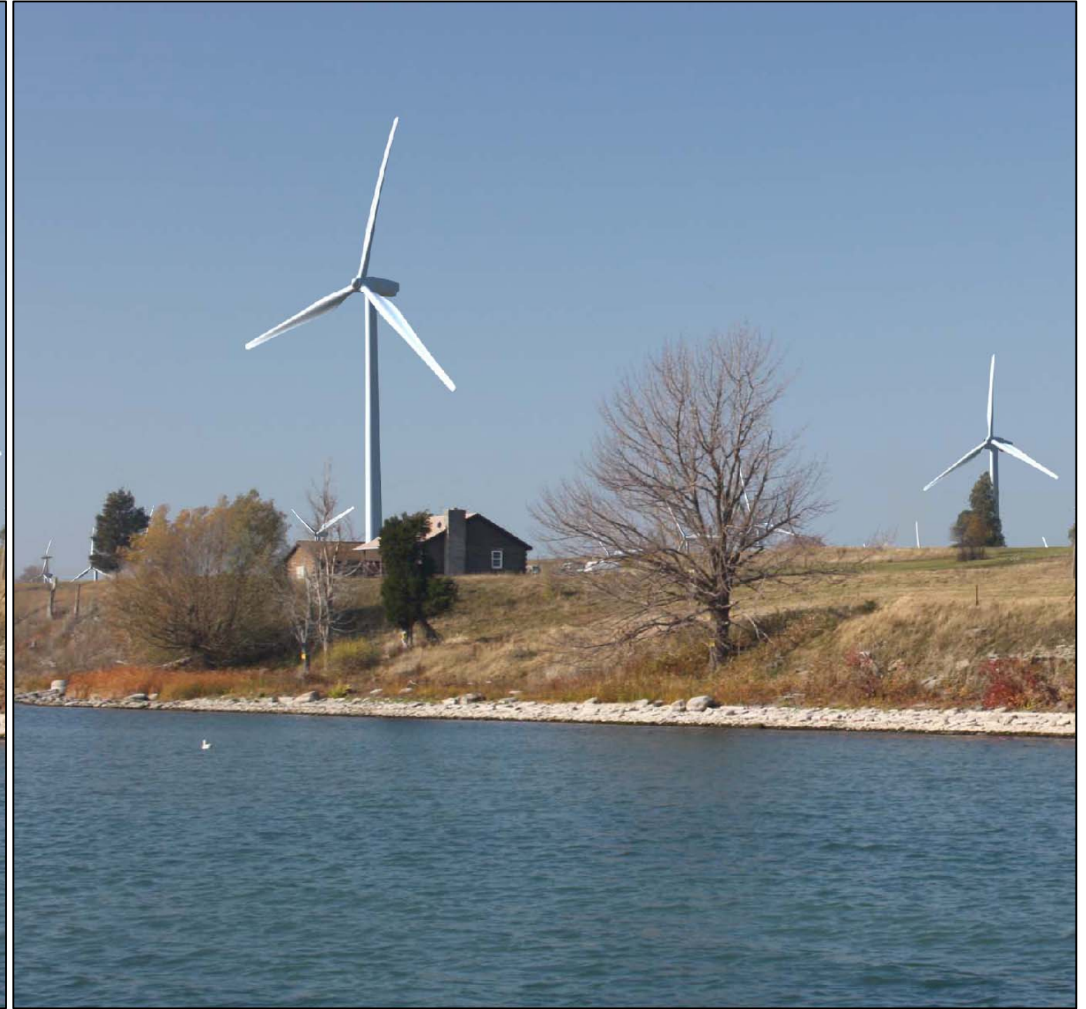
Vestas 3.0 MW Wind Turbine Layout