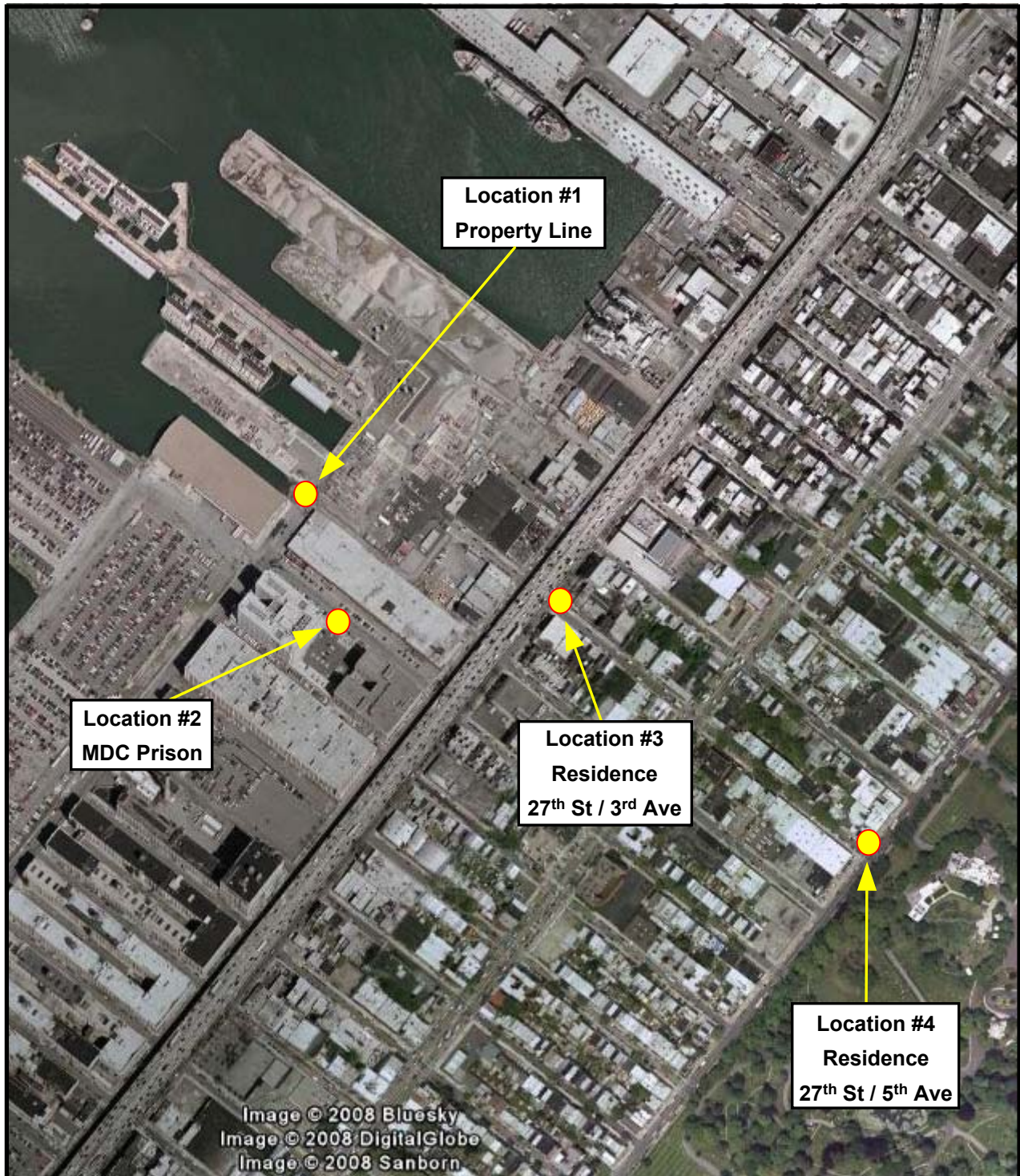
Figure 1 Baseline Sound Level Monitoring Locations Near The US PowerGen Gowanus Generating Station