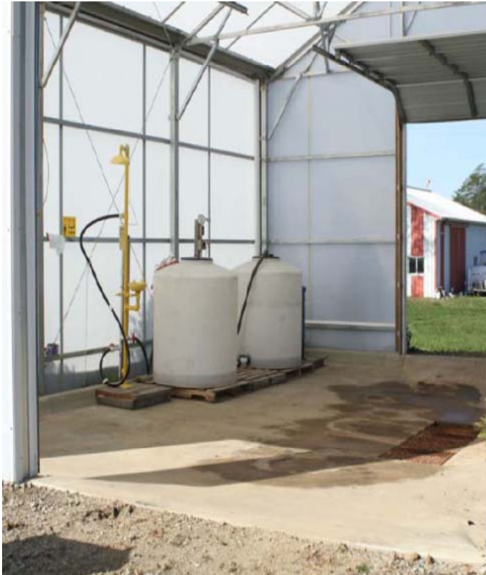
Figure 1: Agricultural Pesticide Handling Facility Installed at Starkie Family Farms, Cutchogue

Construction or installation of APHFs begins after receiving LIAPHF EBP Committee approval. Approved sites receive 75 percent cost sharing pending availability of funding, with maximum reimbursement per handling facility set at thirty thousand dollars ($30,000.00). The LIAPHF Committee reviews and approves reimbursement of eligible expenses after receiving all required documentation. The SCSWCD administers the program and conducts all financial transactions.