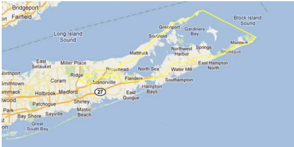
Figure 3: Map of Peconic Estuary (Yellow line outlines estuary)

To date, the Peconic Estuary Program and its partners have made significant progress in implementing numerous priority actions in the PEP CCMP, recently including but not limited to: approval and implementation of the pathogen and nitrogen Total Maximum Daily Loads (TMDLs); Suffolk County's passage of a fertilizer management law; NYSDEC's revised Municipal Separate Storm Sewer System (MS4) permit with new pathogen and nitrogen TMDL requirements; implementation of sub-watershed stormwater management plans addressing impaired waters; intense bay scallop restoration efforts; installation of diadromous fish passage; early detection rapid response invasive species management programs; and the acquisition of a significant amount of open space.