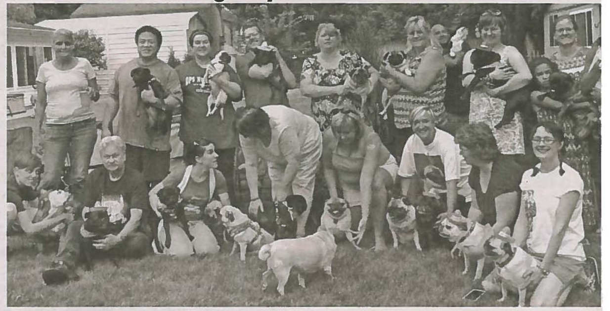
Recently, a grumble of 24 pugs and their owners came together for a "dawg on" summer pug party in Youngstown. Dog owners from Lewiston, Youngstown, Clarence, Lancaster and Amherst attended the event.