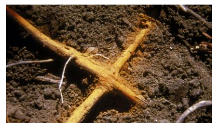
Root graft