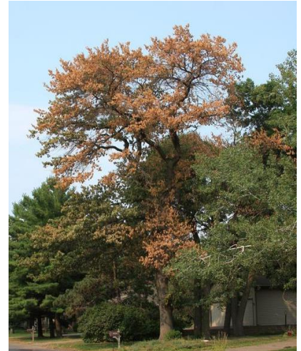
Oak tree killed by oak wilt

Spread underground occurs when roots of nearby red group oaks graft to each other (fuse together), creating a connection through which nutrients and the disease can move. In the Midwest, large blocks of red oak forests have died from the disease in a single season due to their vast network of interconnected roots. In contrast, white group oaks are much less likely to create root grafts, and spore mats rarely form under their bark, significantly reducing the chance of spread from these trees.