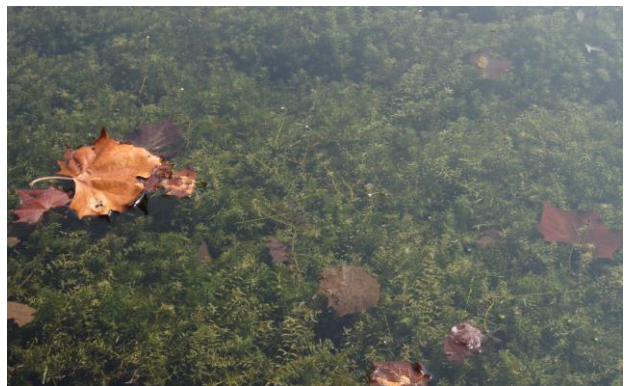
Dense mat of hydrilla in Croton River

In addition to producing seed, hydrilla has green overwintering buds called turions and tubers that grow at the end of the roots and store energy. New populations of hydrilla can sprout from any of these, as well as from plant fragments that easily break off from the main plant. Turions, tubers, and plant fragments can be carried by currents or boats, boat trailers, and fishing gear to new locations.