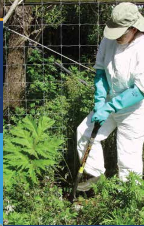
Cutting the plant root