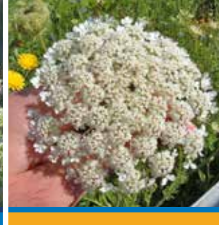
Queen Anne's Lace