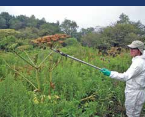
Removing seed heads

Giant hogweed is an invasive, non-native plant classified as a noxious weed. It is unlawful to propagate, sell or transport. In addition to being a health concern, it crowds out other plants and causes soil erosion.