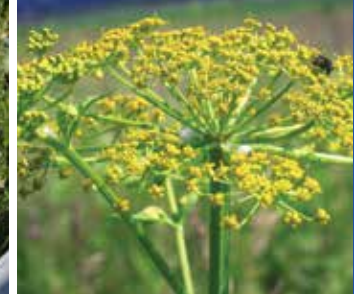
Wild Parsnip DON T TOUCH! CAN CAUSE SEVERE BURNS.

Division of Lands and Forests Forest Health and Protection 21 South Putt Corners Road New Paltz, NY 12561