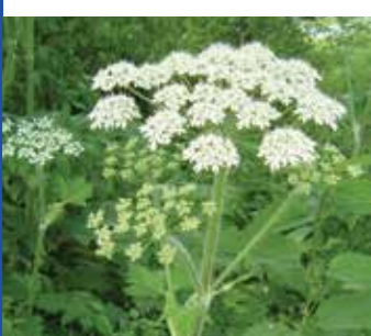
Cow Parsnip May cause burns.