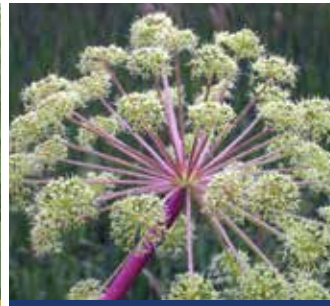
Angelica May cause burns.