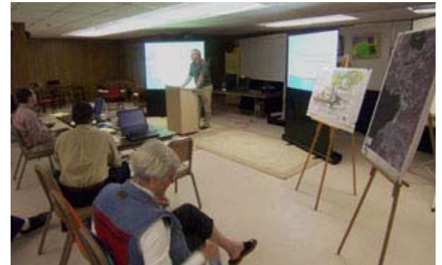
Tupper Lake residents attend a community workshop

The Department received over 50 applications from around the Park, requesting a total of more than $3 million. Applications were evaluated through a pre-established competitive review process. The following projects were awarded funding, as announced at Adirondack Local Government Day in Lake Placid, NY, in March 2008.