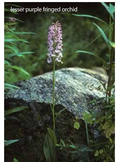
lesser purple fringed orchid

Questions like, "What caused the decline of Hooker's orchid?" justify the great interest in these wonders of the plant kingdom. Wild orchids often generate excitement due to their reputation as rare and exotic plants. Indeed, the more that is learned about them, the more fascinating they become. Consequently, that