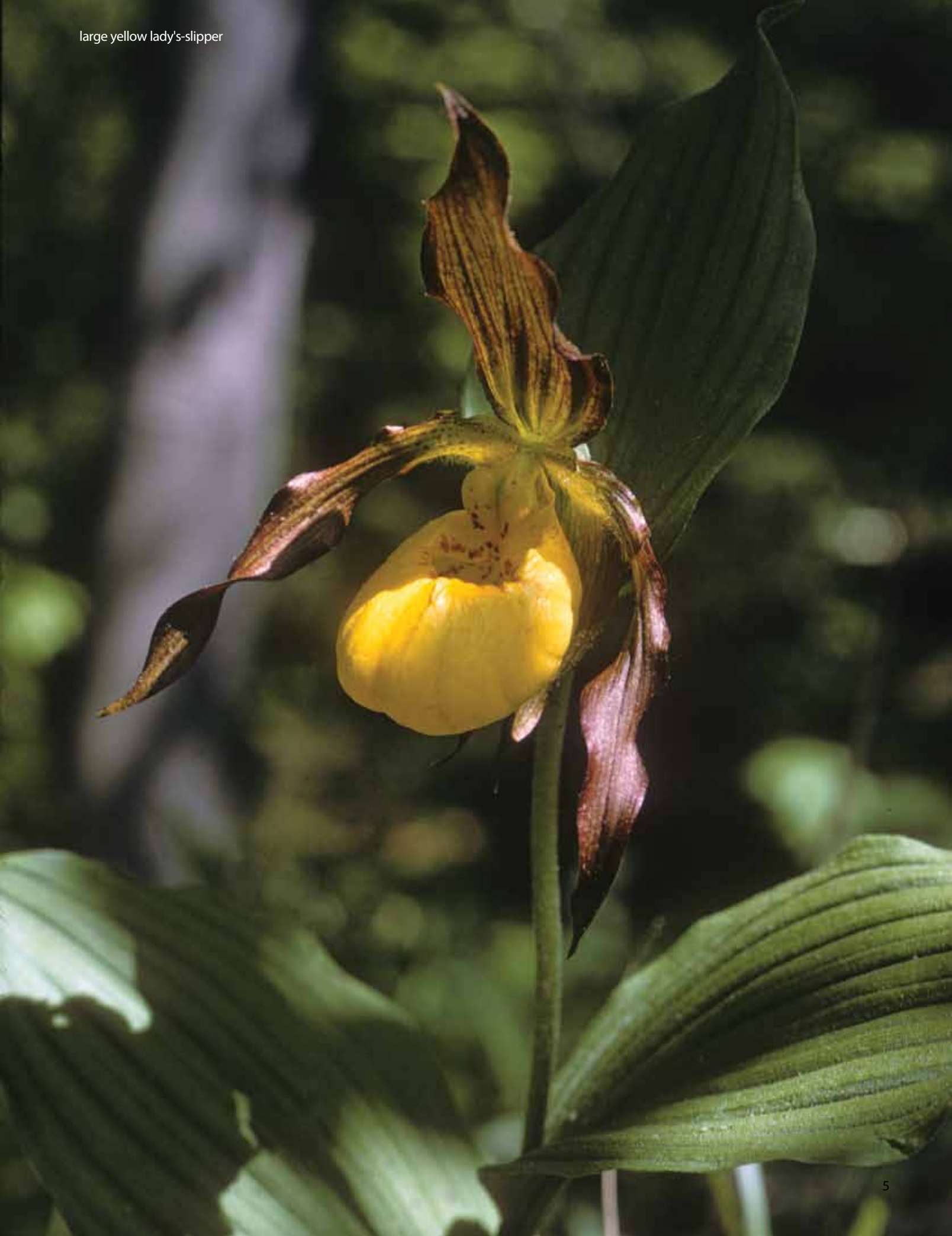
large yellow lady's-slipper