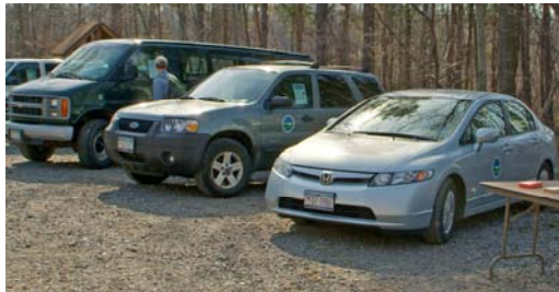
Check out the DEC “green” fleet.

We are also participating in National Environmental Education Week again this year (April 12 to 18). Join us for a variety of programs throughout the week (see page 5); then top it off with our Earth Day Celebration on Saturday. We hope to see you at The Woods this spring!