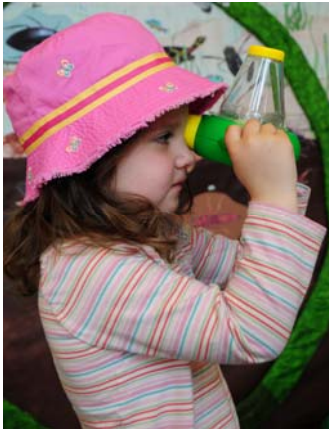
Get up close with nature.

The warmer weather brings another exciting event to Reinstein Woods—our third annual Earth Day Celebration!