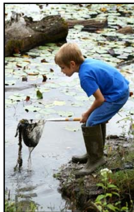
You never know what you'll find in your net at the Lily Pond!