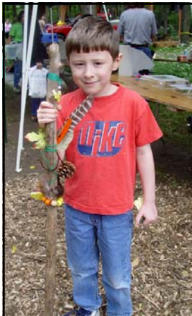
A young festival visitor shows off his decorated walking stick.

Festival will be greeted by costumed creatures of the pond. The festival will feature new crafts, such as making rain sticks and track bandanas, as well as old favorites like decorating a walking stick. Kids will also have the chance