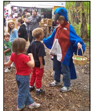
The bluebird, the official NY state bird, greeted Fall Festival visitors last year.

The suggested donation of $2.00 per person at the entrance gate will help Friends of Reinstein Nature Preserve (FORNP) support future education programs at "The Woods."