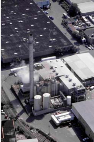
Newark (NJ) 58 MW CHP