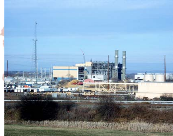
Ontelaunee Energy Center (PA) 550 MW CC