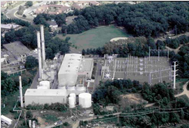
Parlin (NJ) 122 MW CHP