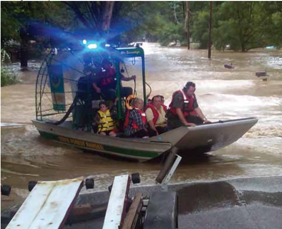
During the flooding caused by Lee, DEC airboats rescued many people stranded in Broome County.

New York State Conservationist, August 2012