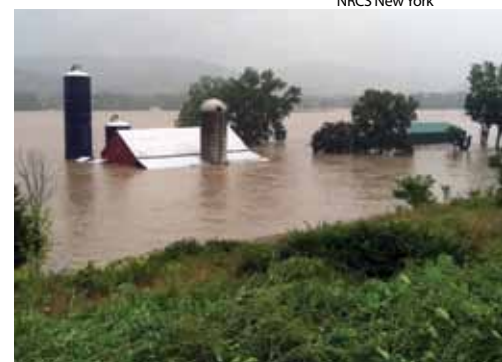
NRCS New York