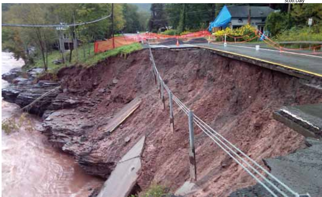
Flooding from Irene destroyed many miles of railways and roads, including these tracks in Middletown and this highway.