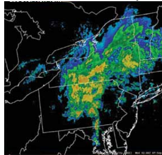
In this radar image of the remnants of tropical storm Lee, the yellow and orange areas indicate very heavy rainfall in the Southern Tier on September 7, 2011.