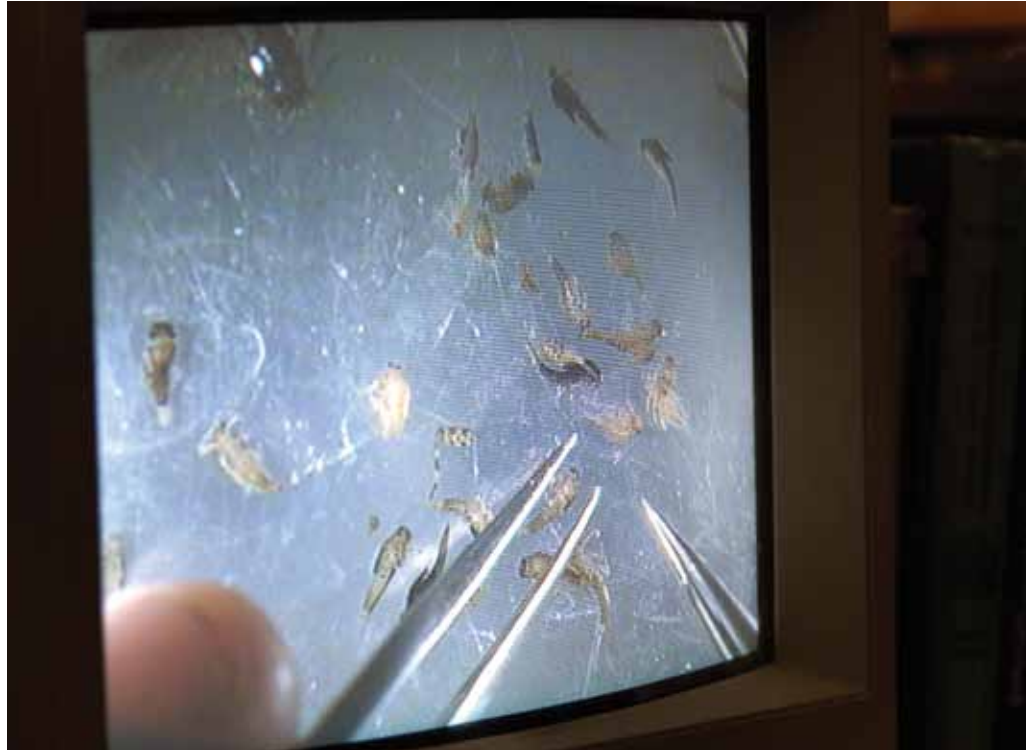
In the affected region's streams, diversity among macroinvertebrates that support gamefish populations was significantly reduced by record floods.

longer even a cyclone. But while drifting over the Gulf's warm waters, Lee accumulated a huge reservoir of water vapor.