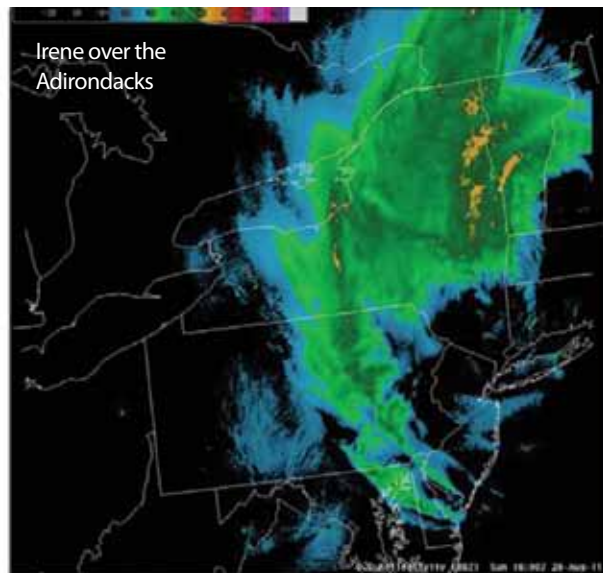
Radar imagery