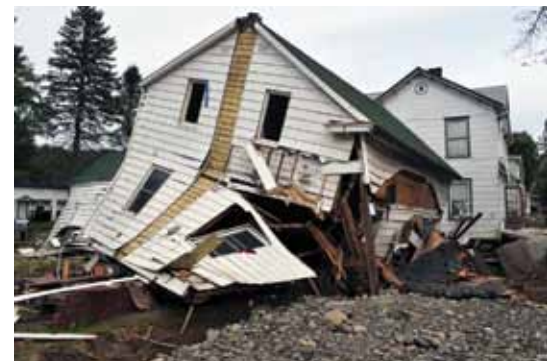
Above: Prattsville was one of the Catskill Mountains communities hit hardest by Irene.