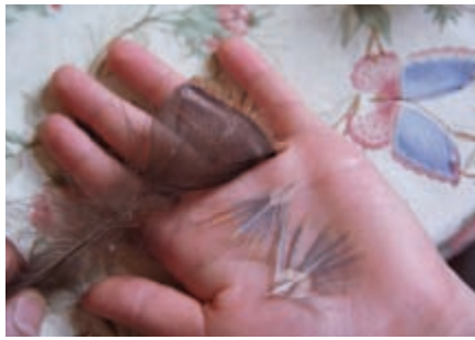
Beautiful turkey feathers will become wings of a different kind.