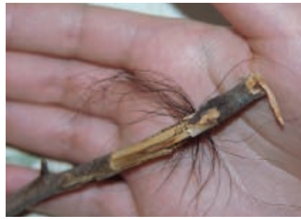
Hair from a black bear snagged in a twig becomes part of a "local fly."