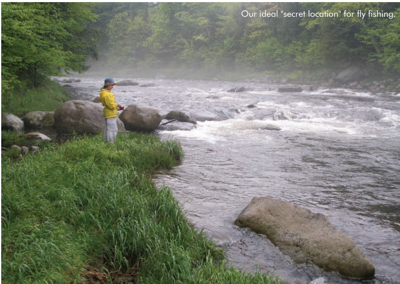
Our ideal "secret location" for fly fishing.

For more information on fishing opportunities in New York, check the DEC fishing website at: www.dec.ny.gov/outdoor/fishing.html .