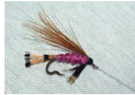
Grouse and Pink, a local modification of the British Woodcock and Pink pattern.

As I explained the concept of attractor flies—things a fish thinks look good to eat, or maybe just good to kill—I trimmed some blue-grey grouse feathers, and looped the nylon thread around them once, twice, three times.