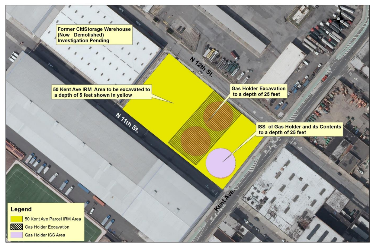
Figure 2 IRM Detail